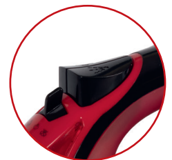
Incl. switchable self-cleaning function