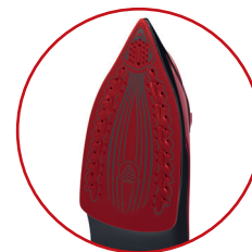
Scratch-resistant ceramic sole plate with outstanding sliding behaviour